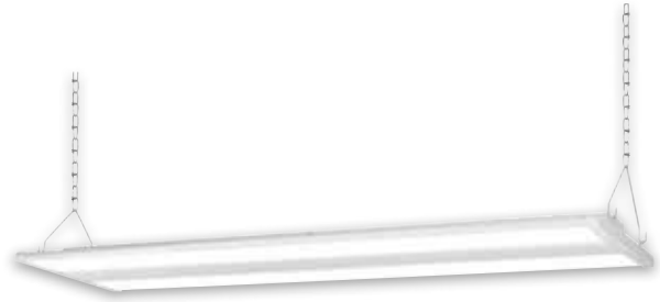
4 ft. 225 Watt LED Linear High Bay Fixture Item No. 65637 White Finish with Frosted Acrylic Diffuser Height: 2.20" Width: 45.87" Depth: 12.60"