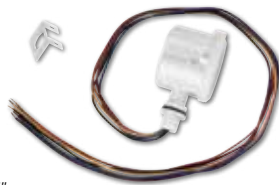
Motion Sensor for High Bay Linear Fixtures 65634, 65635, 65636, 65637 Item No. 6563x6914* Height: 4.13" Width: 3.93" Depth: 4.33"