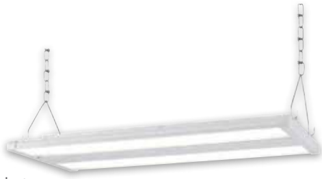
2 ft. 110 Watt LED Linear High Bay Fixture Item No. 65634 White Finish with Frosted Acrylic Diffuser Height: 2.20" Width: 23.82" Depth: 12.60"