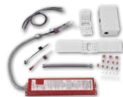
Battery Backup for High Bay Linear Fixtures 65634, 65635, 65636, 65637 Item No. 6563x6915* Height: 2.19" Width: 10.08" Depth: 2.17"

* SPECIAL ORDER ITEM CALL YOUR WESTINGHOUSE LIGHTING REPRESENTATIVE FOR ADDITIONAL INFORMATION