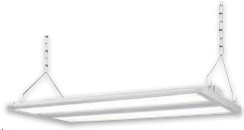
2 ft. 160 Watt LED Linear High Bay Fixture Item No. 65635 White Finish with Frosted Acrylic Diffuser Height: 2.20" Width: 23.82" Depth: 17.32"