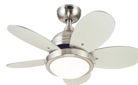
Reversible White Finish Blades