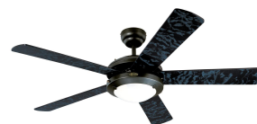
Reversible Marble Finish Blades