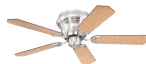
Reversible Bird's Eye Maple Finish Blades