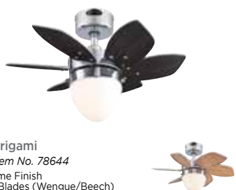
72369 Origami Previous Item No. 78644 24 in. Chrome Finish Reversible Blades (Wengue/Beech) Opal Frosted Glass Includes (1) Candelabra (E12) Base, 4.5 Watt G16-1/2 LED Lamp (WL Lamp #50241) Pull Chains Included