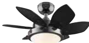
72246 Quince Previous Item No. 72243 24 in. Gun Metal Finish Reversible Blades (Black/Graphite) Opal Frosted Glass Includes 16 Watt Integrated LED Pull Chains Included