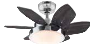
72366 Quince Previous Item No. 78631 24 in. Chrome Finish Reversible Blades (Wengue/Beech) Opal Frosted Glass Includes 16 Watt Integrated LED Pull Chains Included