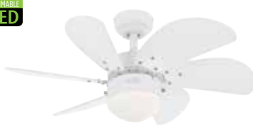
72344 Turbo Swirl Previous Item No. 7814565 30 in. White Finish White Blades Opal Frosted Glass Includes (1) Candelabra (E12) Base, 4.5 Watt G16-1/2 LED Lamp (WL Lamp #50241) Pull Chains Included