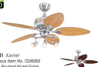
72331 Xavier Previous Item No. 7226565 44 in. Brushed Nickel Finish with Copper Accents Reversible Blades (Maple/Mahogany) Spot Lights Includes (3) GU10 Base, 6.5 Watt MR16 LED Lamps (WL Lamp #53032) Pull Chains Included