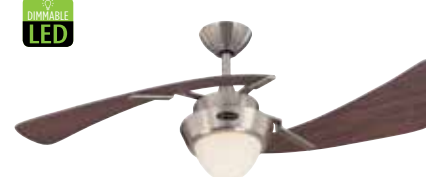
72311 Harmony Previous Item No. 72141 48 in. Brushed Nickel Finish Weathered Maple Blades Opal Frosted Glass Includes (2) Candelabra (E12) Base, 4.5 Watt B11 LED Lamps (WL Lamp #43168) Pull Chains Included