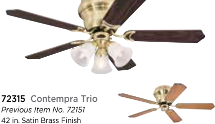
72315 Contempra Trio