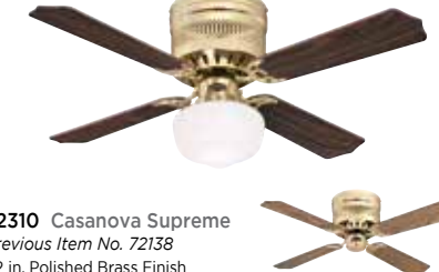
72310 Casanova Supreme