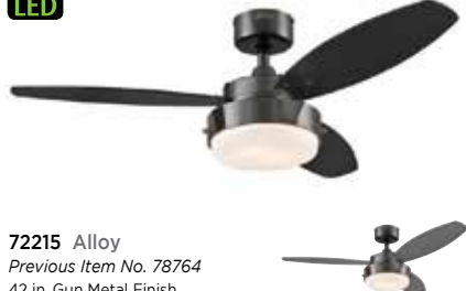
72215 Alloy Previous Item No. 78764 42 in. Gun Metal Finish Reversible Blades (Black/Graphite) Opal Frosted Glass Includes (2) Medium (E26) Base, 8 Watt T7 LED Lamps (WL Lamp #33199) Pull Chains Included