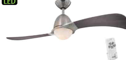
72230 Solana Previous Item No. 72161 48 in. Brushed Nickel Finish Wengue Blades Opal Frosted Glass Includes (2) Candelabra (E12) Base, 4.5 Watt G16-1/2 LED Lamps (WL Lamp #50241) Remote Control Included