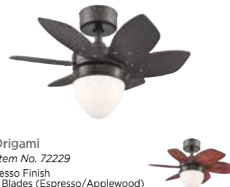
72328 Origami Previous Item No. 72229 24 in. Espresso Finish Reversible Blades (Espresso/Applewood) Opal Frosted Glass Includes (1) Candelabra (E12) Base, 4.5 Watt G16-1/2 LED Lamp (WL Lamp #50241) Pull Chains Included