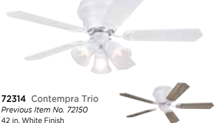
72314 Contempra Trio