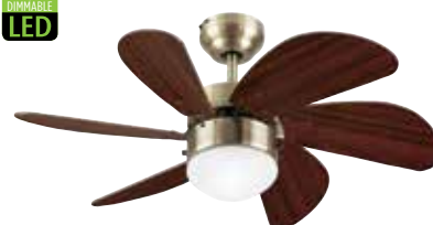
72347 Turbo Swirl Previous Item No. 7824865 30 in. Antique Brass Finish Walnut Blades Opal Frosted Glass Includes (1) Candelabra (E12) Base, 4.5 Watt G16-1/2 LED Lamp (WL Lamp #50241) Pull Chains Included