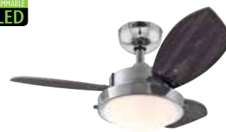
72241 Wengue Previous Item No. 78763 30 in. Chrome Finish Reversible Blades (Wengue/Beech) Opal Frosted Glass Includes 16 Watt Integrated LED Pull Chains Included