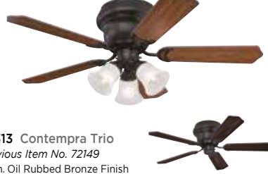
72313 Contempra Trio