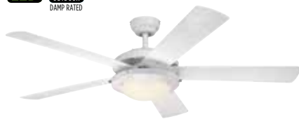
72302 Comet Previous Item No. 72008 52 in. White Finish White ABS Blades Frosted Glass Includes 16 Watt Integrated LED Pull Chains Included