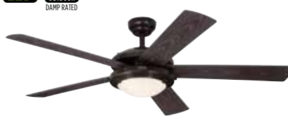
72301 Comet Previous Item No. 72007 52 in. Espresso Finish Espresso ABS Blades Frosted Glass Includes 16 Watt Integrated LED Pull Chains Included