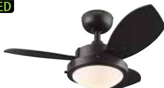
72330 Wengue Previous Item No. 72245 30 in. Espresso Finish Reversible Blades (Espresso/Dark Cherry) Opal Frosted Glass Includes 16 Watt Integrated LED Pull Chains Included