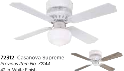
72312 Casanova Supreme