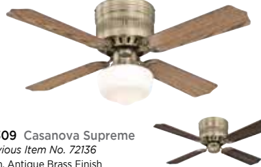
72309 Casanova Supreme