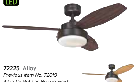
72225 Alloy Previous Item No. 72019 42 in. Oil Rubbed Bronze Finish Reversible Blades (Walnut/Family Oak) Opal Frosted Glass Includes (2) Medium (E26) Base, 8 Watt T7 LED Lamps (WL Lamp #33199) Pull Chains Included