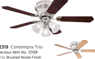
72319 Contempra Trio