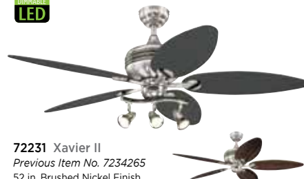
72231 Xavier II Previous Item No. 7234265 52 in. Brushed Nickel Finish with Gun Metal Accents Reversible Blades (Graphite/Weathered Maple) Spot Lights Includes (3) GU10 Base, 6.5 Watt MR16 LED Lamps (WL Lamp #53032) Pull Chains Included