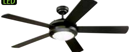
72242 Comet Previous Item No. 7801665 52 in. Matte Black Finish Reversible Blades (Black/Black Marble) Frosted Glass Includes 16 Watt Integrated LED Pull Chains Included