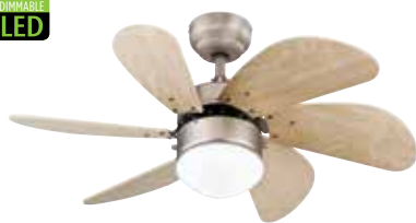
72240 Turbo Swirl Previous Item No. 7814465 30 in. Brushed Aluminum Finish Light Maple Blades Opal Frosted Glass Includes (1) Candelabra (E12) Base, 4.5 Watt G16-1/2 LED Lamp (WL Lamp #50241) Pull Chains Included