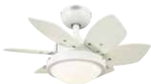
72247 Quince Previous Item No. 72471 24 in. White Finish Reversible Blades (White/Beech) Opal Frosted Glass Includes 16 Watt Integrated LED Pull Chains Included