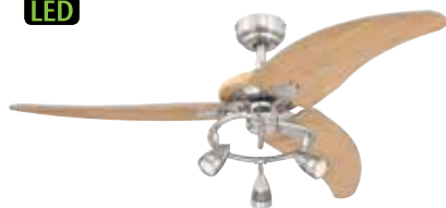
72357 Elite Previous Item No. 78505 48 in. Brushed Nickel Finish Beech Blades Spot Lights Includes (3) GU10 Base, 6.5 Watt MR16 LED Lamps (WL Lamp #53032) Pull Chains Included