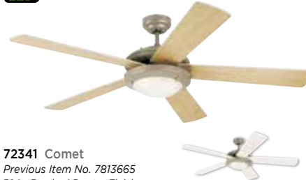
72341 Comet Previous Item No. 7813665 52 in. Brushed Pewter Finish Reversible Blades (Light Maple/White) Frosted Glass Includes 16 Watt Integrated LED Pull Chains Included