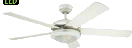
72336 Comet Previous Item No. 7801765 52 in. White Finish Reversible Blades (White/White Washed Pine) Frosted Glass Includes 16 Watt Integrated LED Pull Chains Included