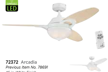
72372 Arcadia Previous Item No. 78691 46 in. White Finish Reversible Blades (Light Maple/White) Frosted White Alabaster Glass Includes (2) Candelabra (E12) Base, 4.5 Watt B11 LED Lamps (WL Lamp #43168) Remote Control Included