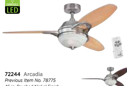
72244 Arcadia Previous Item No. 78775 46 in. Brushed Nickel Finish Reversible Blades (Beech/Weathered Maple) Frosted White Alabaster Glass Includes (2) Candelabra (E12) Base, 4.5 Watt B11 LED Lamps (WL Lamp #43168) Remote Control Included