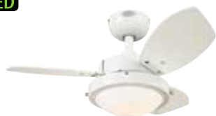
72333 Wengue Previous Item No. 72472 30 in. White Finish Reversible Blades (White/Beech) Opal Frosted Glass Includes 16 Watt Integrated LED Pull Chains Included