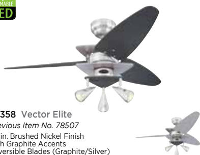
72358 Vector Elite Previous Item No. 78507 42 in. Brushed Nickel Finish with Graphite Accents Reversible Blades (Graphite/Silver) Spot Lights Includes (3) GU10 Base, 6.5 Watt MR16 LED Lamps (WL Lamp #53032) Pull Chains Included