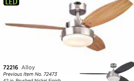
72216 Alloy Previous Item No. 72473 42 in. Brushed Nickel Finish Reversible Blades (Beech/Wengue) Opal Frosted Glass Includes (2) Medium (E26) Base, 8 Watt T7 LED Lamps (WL Lamp #33199) Pull Chains Included