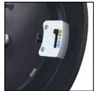
Color Temperature Selection Switch