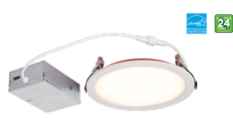
53120 15W Fire-Rated Slim Recessed LED Downlight Color Temperature Selection 6 in. Dimmable 2700K, 3000K, 3500K, 4000K, 5000K, 120 Volt, Box Height: 2.32" Diameter: 7.17"