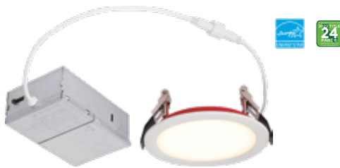
53100 11W Fire-Rated Slim Recessed LED Downlight Color Temperature Selection 4 in. Dimmable 2700K, 3000K, 3500K, 4000K, 5000K, 120 Volt, Box Height: 2.32" Diameter: 5.04"

Use a two-hour fire-rated floor/ceiling assembly constructed in accordance with material and construction specifications of UL Design No. UL 505, L511, L536, L538, L541, L556, L577, M500, M510, M521, or M543.