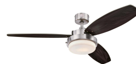
Reversible Wengue Finish Blades