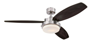
Reversible Wengue Finish Blades