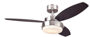
Reversible Wengue Finish Blades