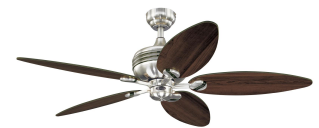
Reversible Weathered Maple Finish Blades