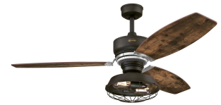
Reversible Reclaimed Hickory Finish Blades