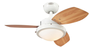
Reversible Beech Finish Blades