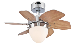
Reversible Beech Finish Blades