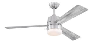
Reversible Gray Teak Finish Blades