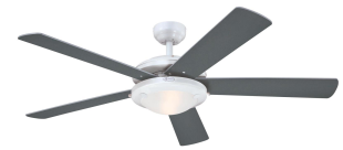
Reversible Graphite Finish Blades