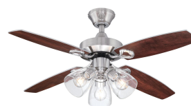
Reversible Applewood Finish Blades