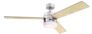
Reversible Light Maple Finish Blades